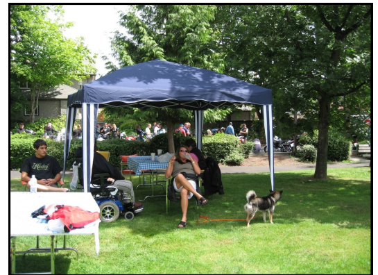
Little shade, comfy chair and good company.

Bah! LoL...To those of you who didn't make it. You missed a really good, laid back, relaxing, positively beautiful time. Hope to see you all next