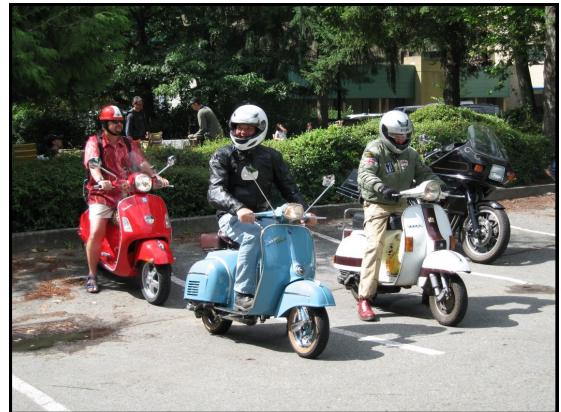
All kinds of Rides !