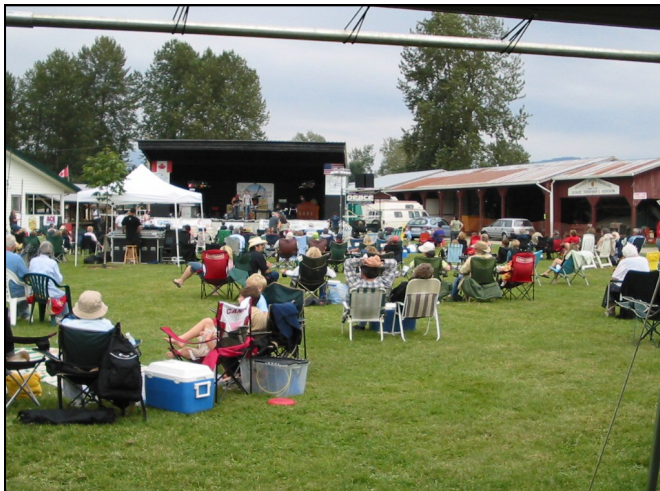
Bring your family and lawn chairs, relax and enjoy great music!